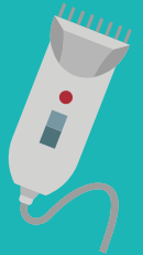
UNSTERILE GROOMING EQUIPMENT

Hepatitis B cannot be transmitted through: