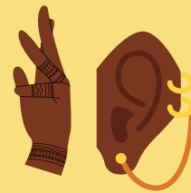
UNSTERILE TATTOO & PIERCING EQUIPMENT