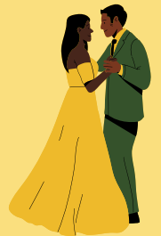
HUGGING OR KISSING

Hepatitis B does not affect only certain people and is not a punishment for bad behavior. Learning your hepatitis B status is important. Know the facts, get tested, and get vaccinated to protect yourself and your loved ones from hepatitis B!