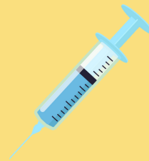
UNSTERILE NEEDLES & HEALTHCARE EQUIPMENT