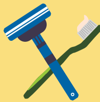
SHARING HYGIENE ITEMS