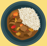
SHARING A MEAL