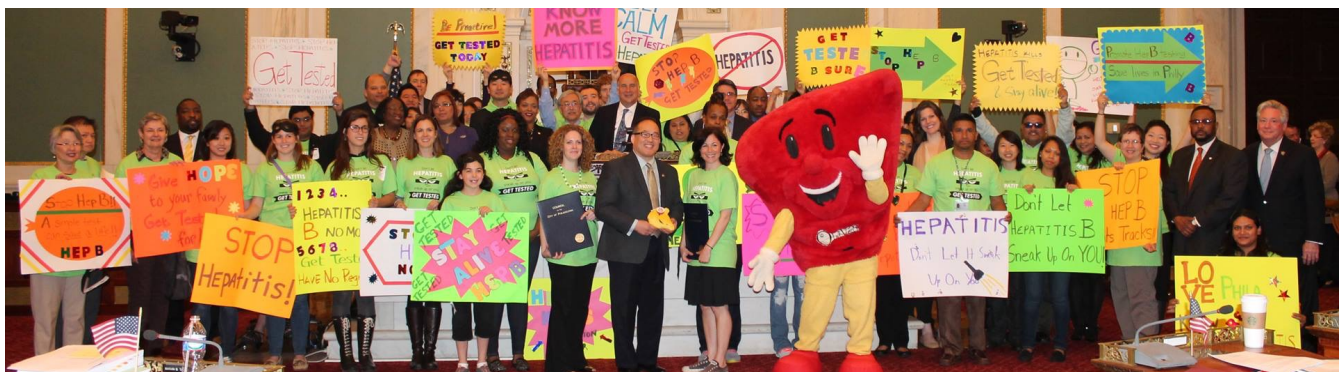
2014: Hep B Awareness Month with O’Liver and Councilman Oh