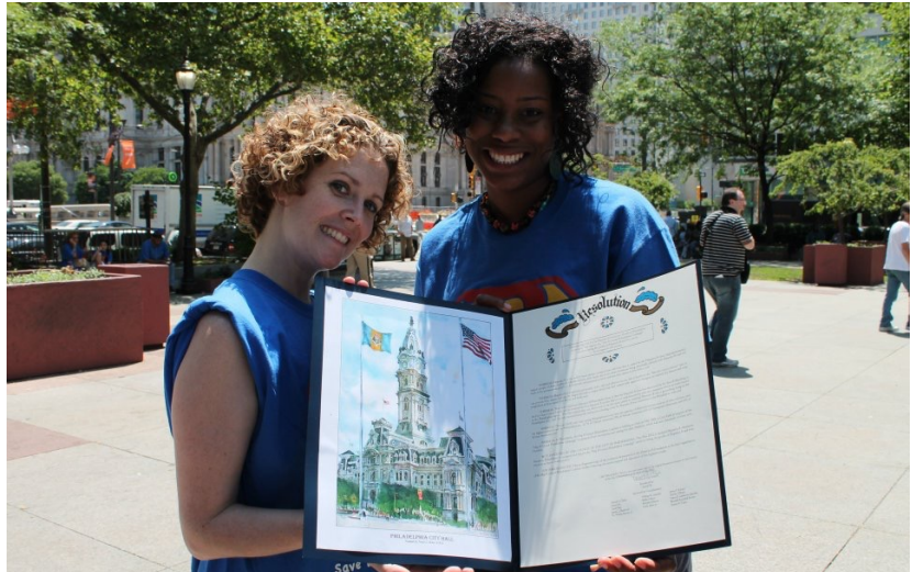
2012: City Resolution declaring May as Hepatitis B Awareness Month in Philadelphia